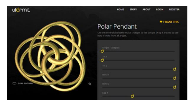
Figure 3 : Parametric customization approach for Uformit.