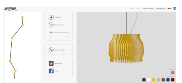
Figure 4 : Generative customization approach for Anylamp.

In addition to offering different types of options by considering the method of customization, some researchers agreed that toolkits allow consumers to engage in utilitarian, kinesthetic or visual customization based on the functions a product can possess, and similar classifications were also defined as functionality, fit (ergonomic) and style (aesthetic) [60], [8]. [50] extended this finding to five dominant types of options: fit, function, aesthetic, quality grade and packaging. In particular, a number of researchers focused on the functional and aesthetic options offered by MC systems, and found that they can lead to different consumer behaviors [72], [14], [18], [7].