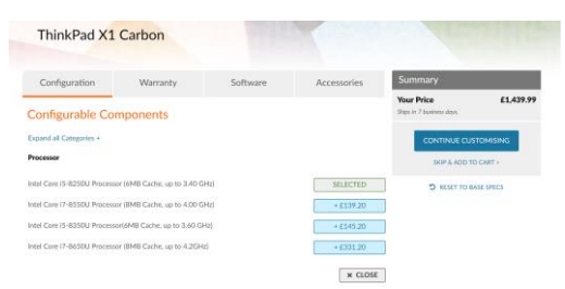
Figure 2 : Modularity customization approach for Lenovo ThinkPad.